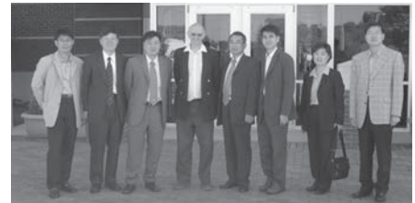
Representatives from Korea University visit the NFSTC in August.