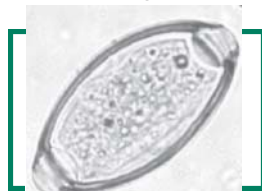
whipworm egg