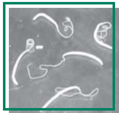
whipworms

A nother major goal of this grant is to encourage veterinarians to enter into the field of research to contribute findings and cures impacting both human and animal medicine. ▲