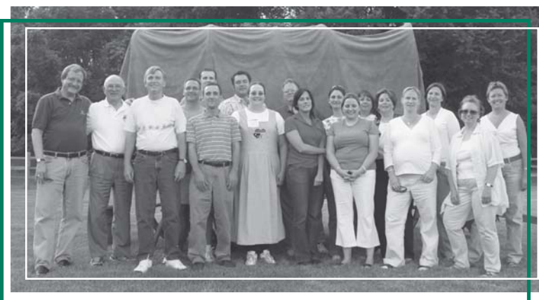
MSU graduate students, enrolled in the VM 810 on-campus component of the ProMS program, take a break from the course while at MSU's Brook Lodge.

program represented many facets of the food industry, including food processing and packaging, the U.S. military and a regulatory agency. This is the only on-campus course for students in this Professional Master of Science program with the remainder of the courses